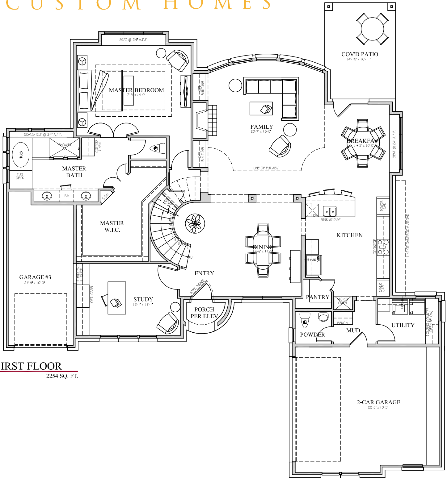
FIRST FLOOR 2254 SQ. FT.

In an effort to provide you with a better home, plans are subject to change & improvement. Measurements are approximate, and vary by elevation.